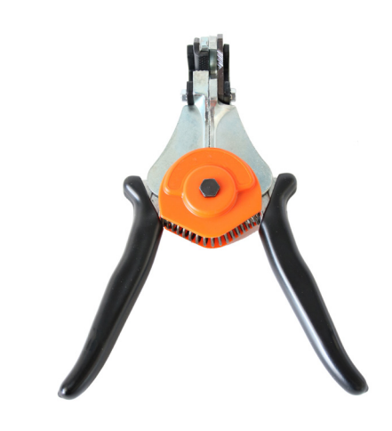
Pic. 1 Jacket stripper