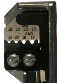
Pic. 2 Cavities