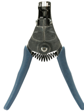
Pic. 1 Jacket stripper