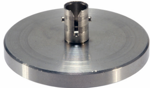
Pic. 1 Polishing jig

Assembled Plastic Optical Fibers have to be polished to achieve optimal attenuation values. The fibers are polished until the fiber end face is flush with the assembled connector. A hard and plain support plate (e. g. glass plate), an abrasive and a polishing jig is used for an appropriate fiber end face treatment. The F-ST polishing jig is suitable for F-ST fiber optic connectors based on IEC 61754-22 standard.